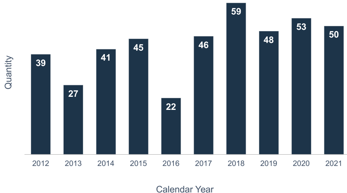
CDER's Annual Novel Drug Approvals

Before PDUFA, it often took FDA more than two years to review new medicines