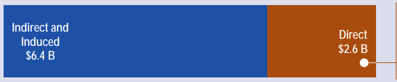
Total Output Supported in 2008 = $9.0 B

• CONTRIBUTING TO THE ECONOMY • Economic output represents the value of the goods and services produced by the sector and its ripple effects. In 2008, the Minnesota biopharmaceutical sector supported $9.0 billion in total output.